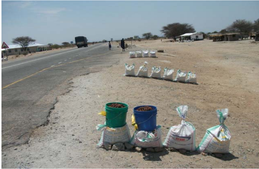
Plate 6: Tamarind and ubuyu from Bahi wetlands sold along the Dodoma-Singida road