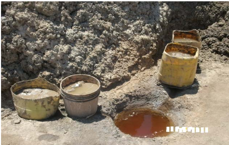
Plate 5: Salt Making at Ilindi Village, Bahi Wetland

Surughai, the largest swamp in the area, has a number of locations on the edges where salt deposits are found. The popular spots are at Chali Igongo and Naguro in Bahi district and Kinangali in Manyoni district, but salt is also produced in Mpamatwa, Lamaiti, Kigwe and Ilindi wards of Bahi district. Although the salt produced in these areas finds a market as far away as Burundi there are no official records of the levels of production. Our estimates based on the areas we visited suggest that about 4,200 tons of salt valued at TS 294,000,000/= is produced annually in the area. The amount of salt that is produced is constrained by the type of technology used to produce it. Salt is processed by looking for salt bearing sand, mixing the sand in water, decanting the solution, then boiling the salty water until the salt is left in the boiling pans. This process consumes a lot of fuel wood. Much more salt could be produced if the technology was improved. Traditional salt production employs over 5,000 people particularly during the dry season.