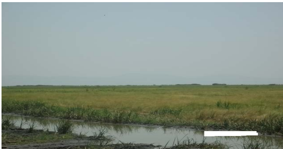
Plate 1: Bahi Wetlands

The population in the Bahi Swamp area relies upon its natural resources to generate an income and would be impacted adversely by uranium mining. A good example is the established small-scale rice irrigation schemes which divert water from the inflowing rivers. A combination of water extraction for uranium mining and an increase in irrigation development, would pose a significant threat to the ecological integrity of the wetland as well as the livelihoods of many of the people who depend on it. In addition, the remaining water supplies required for other local uses could be contaminated by mining, leading to increased risk to the health and well-being of the local inhabitants.