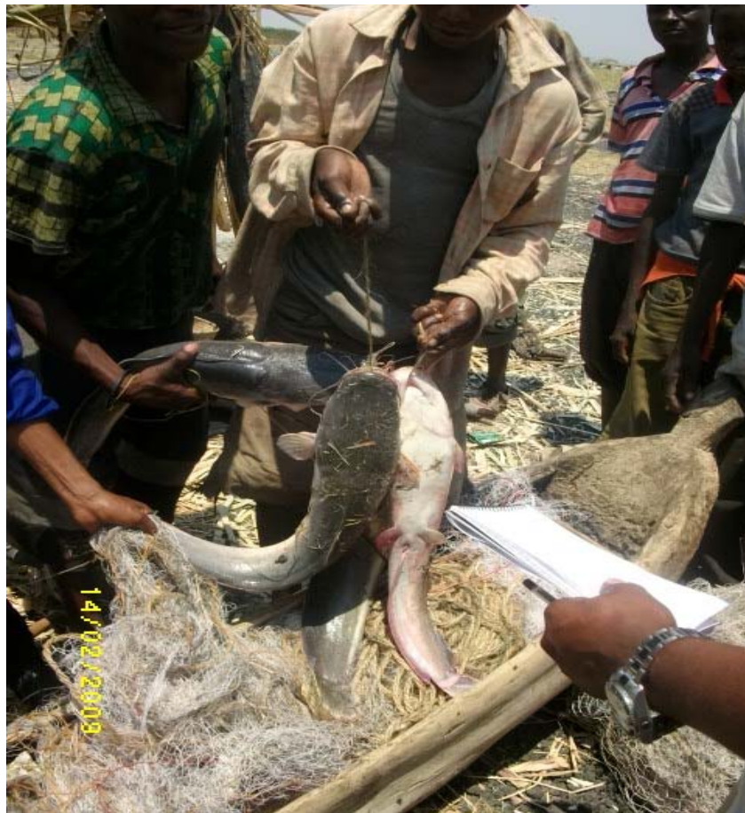
Plate 4: Fishing in Bahi Wetlands

The fishing industry in the wetlands offers employment to over 1,000 people mostly on a seasonal basis i.e. during the rainy season. The total value of the fishing industry is currently estimated at TS 3,760,500,000/=. For details see Appendix 3.