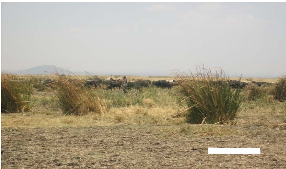
Plate 3: Livestock Grazing in Bahi wetlands

The district is estimated to have 133,156 hectares of suitable land for grazing livestock. The estimated number of cattle, sheep and goats and their values in 2010 are as follows: 224,220 cattle valued at 78,477,000,000/= TS; 47,472 goats valued at 1,186,800,000/= TS; and 9,995 sheep valued at 249,875,000/= TS – making a total value of major livestock of 79,913,675,000/= TS. In reality, the total value is expected to be somewhat higher if all marketable animals and birds (including pigs, chicken, etc.) kept were included in the evaluation. For details see Appendix 2.