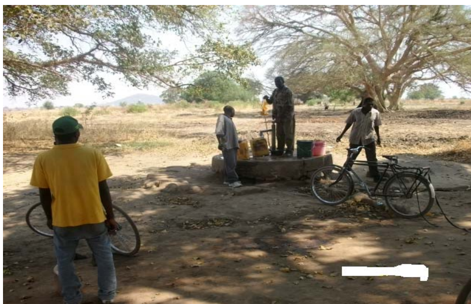
Plate 2: Water source within Bahi Swamp